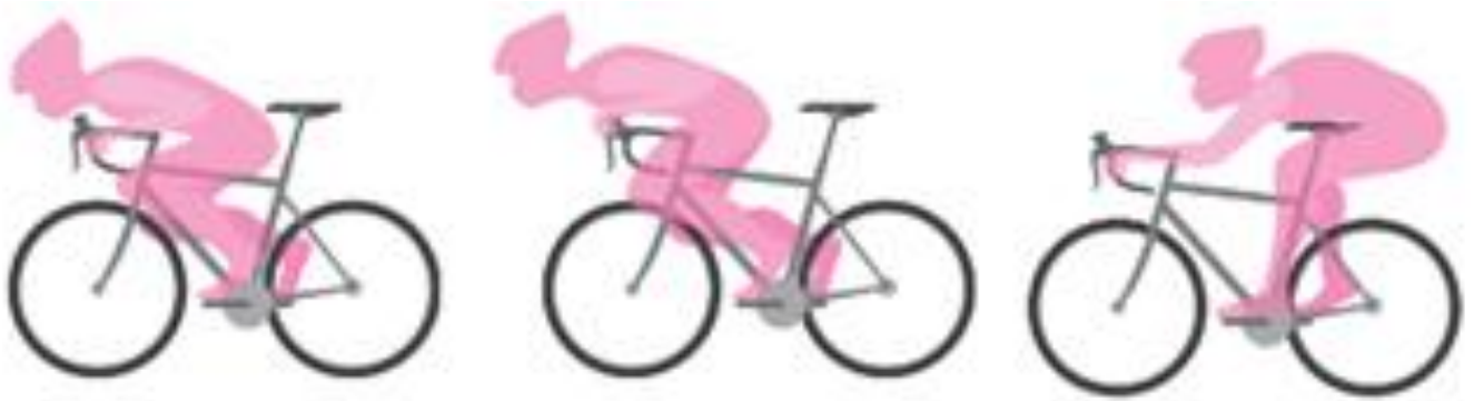
Image 3: Forbidden positions in all races: