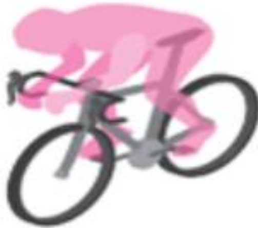
Image 2: Allowed position only in draft illegal races: